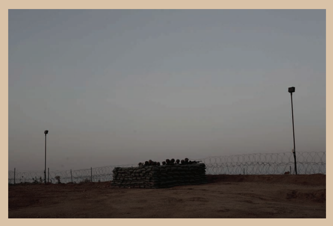
(cover) African Union peacekeepers on patrol near Kutum, North Darfur, January 2007. (back cover) Peacekeepers look out from their bunker in Kutum.

This report describes how the government of Sudan is actively obstructing and undermining the ability of the force to protect civilians. Rather than challenging Sudan to fulfil its commitment to Security Council Resolution 1769, politicians and members of the international community are instead wrangling over details and shirking their own responsibilities to support the force.