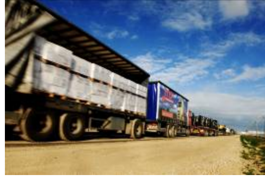
Left: Foreign nationals leaving the Gaza Strip (IDF Spokesman, January 2, 2009). Right: Humanitarian aid delivered through the Kerem Shalom crossing (IDF Spokesman, January 2, 2009).