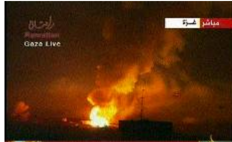
Explosion at the gas terminal in the Zeitun neighborhood of Gaza City during the land operation (Al-Jazeera TV, January 3, 2009).

9. In addition, at least five tunnels under the Egyptian-Gaza border were attacked, as were eight storehouses and locations for manufacturing weapons, five Hamas posts, rocket launchers and rocket launching areas, mosques serving terrorist purposes, houses of terrorist operatives and the offices of the Hamas magazine Al-Risala in Gaza City during the IDF ground operation.