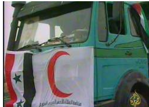
Left: A consignment of humanitarian aid from Syria on its way to the Gaza Strip via Jordan (Al-Jazeera TV, January 3, 2009). Right: Humanitarian aid from Turkey delivered through the Kerem Shalom crossing (IDF Spokesman, January 2, 2009).