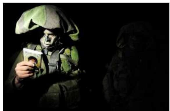
Final preparations before the land incursion (IDF Spokesman, January 3, 2009).

4. Land activity: At 2000 hours on January 3 a large force composed of infantry, tanks and the engineer corps entered the Gaza Strip, supported by the IAF and the Israeli Navy.