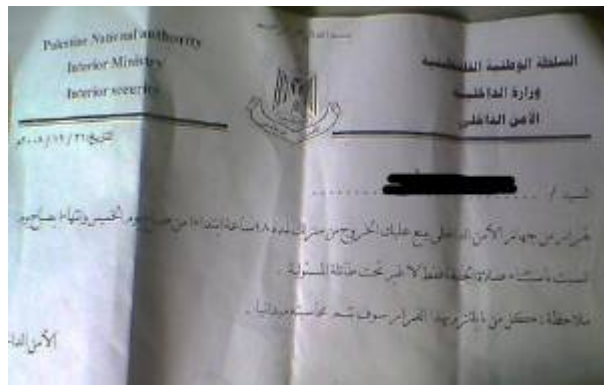
A copy of the notice sent by the Hamas administration to Fatah operatives in the Gaza Strip (PalPress website, January 2, 2009).