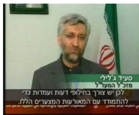
Iranian National Security Council Secretary Saeed Jalili.