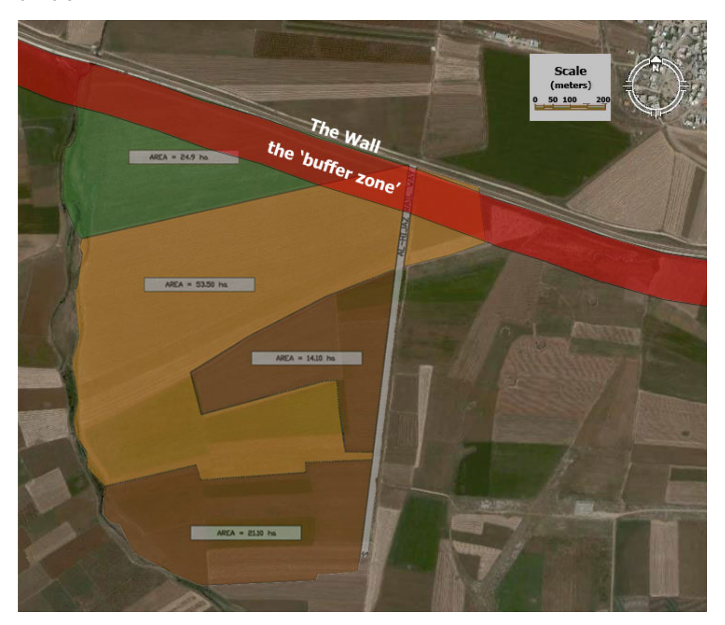
Map 1: JIE is partly located in the 'buffer zone' for the illegal Apartheid Wall. 33% of the land for the proposed site is not owned and will need to be confiscated from its current owners